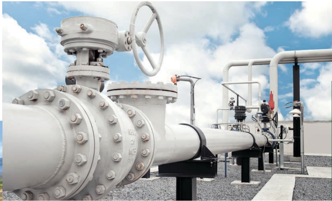
ABB Inc. Measurement & Analytics 1 800 858-3847 (North America) Tel.: +1 418-877-2944 (other countries) Email: icos.sales@ca.abb.com