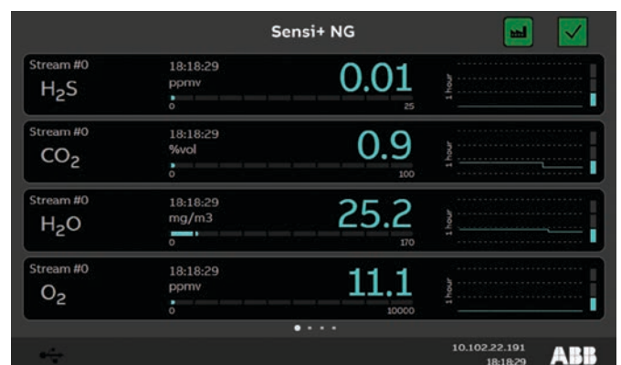
04 Local HMI main screen with multiple information in the blink of an eye